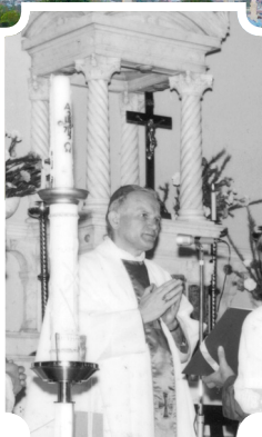
Cardinal Wojtyla (later Pope St John Paul II) at Our Lady of Victories in 1973.